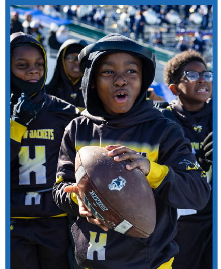
YOUTH FOOTBALL INITIATIVE