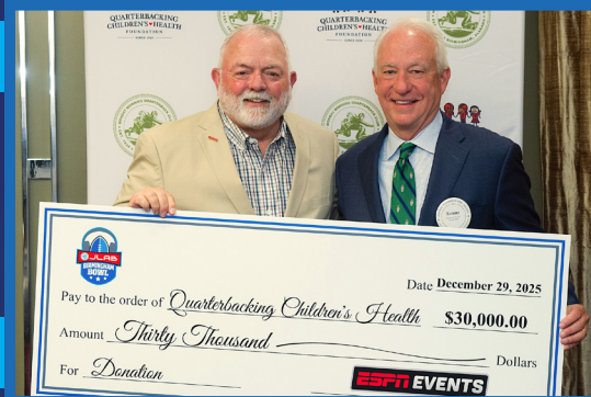
QUARTERBACKING CHILDREN'S HEALTH

Since 2006, the JLab Birmingham Bowl has distributed thousands of complimentary tickets to local First Responders and their families and members of the Armed Forces, military veterans and their families through the generous donations of our conference partners and sponsors.