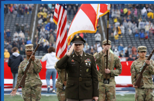
HONORING OUR ARMED FORCES AND FIRST RESPONDERS