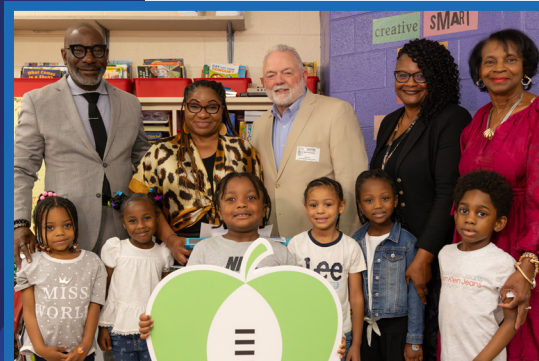
EXTRA YARD FOR TEACHERS